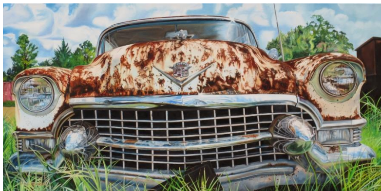
55 Caddy – 12” x 20”