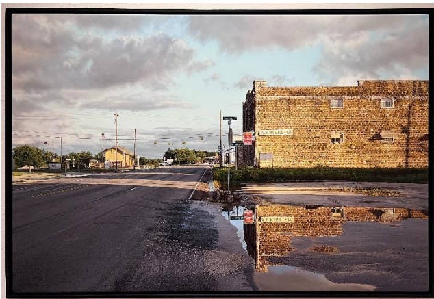
Shadows & Reflections / Bertram, TX, Acrylic, 2006