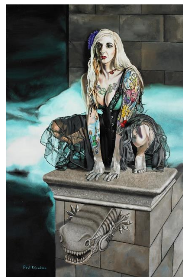
Color Guard – 12” x 18”