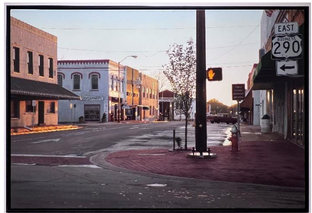
290 East / Brenham, TX Acrylic on Canvas, 2008