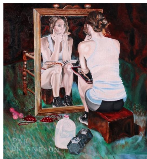
Fit Girl at the Mirror – 11” x 14”

(All of these prints are available for purchase. Please email me.)