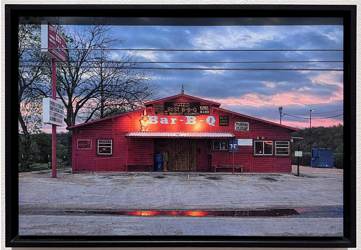
Bar-B-Q / Marble Falls, 2022 – Acrylic on Linen