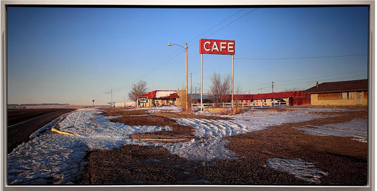
Sands Motel & Cafe - Rod Penner – Acrylic on Canvas - 2019