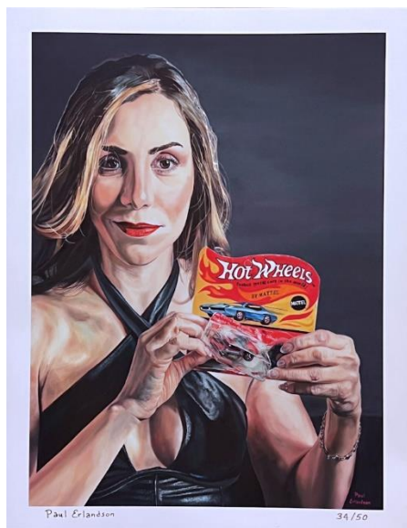
Redline – 16” x 20”